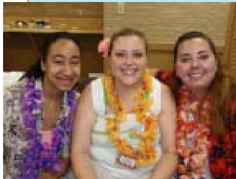
“Twenty-something” Jr. Directresses