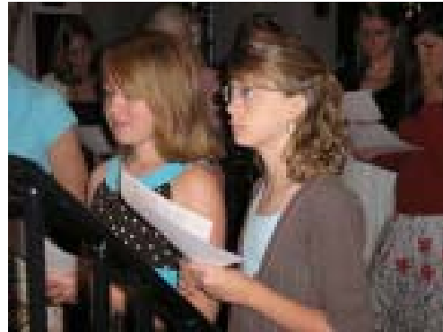
Members of Sts. Mary and Martha Junior Daughters from St. Augustine, FL