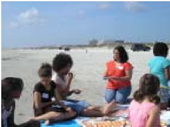
Members of Sts. Mary and Martha Junior Daughters from St. Augustine, FL

After spending hour after hour on that scorching hot roof, all of our group's hard work was beginning to pay off. We were making noticeable